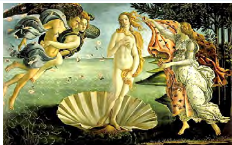
Botticelli's The Birth of Venus